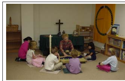
Godly Play Storyteller & Assistants

Godly Play Storytellers. Godly Play is for children ages 4 through 3 rd grade. We have two Godly Play classes at Trinity. The first is for ages 4 through 1 st grade and the other for the 2 nd and 3 rd grades. The Godly Play curriculum moves through the circle of the Church year using hands-on story telling material. This is a very rewarding ministry, teaching our children and learning with them all the wonder biblical stories is a wonderful gift that you give to a child. We will teach you how to teach Godly Play. The only requirements are love for children and a couple of hours during the week before you would be scheduled to learn the story. We have a schedule for both rooms and you can teach to fit your schedule.