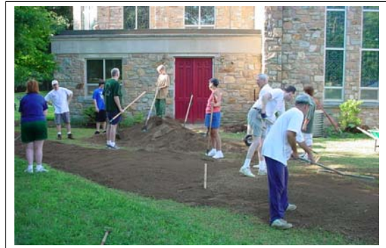
Grounds Workers moved heaven (rain runoff) & earth

Grounds Workers. Several times a year workers assemble to clean up the grounds or tackle special projects like regrading and seeding.